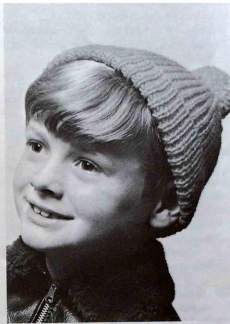
Plain version of cap.