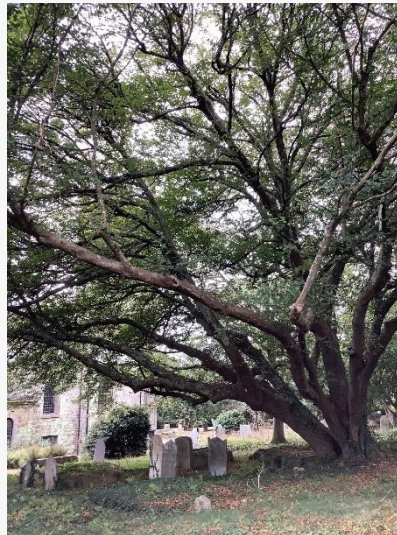
Limes (At least 2 trees and possibly 1 Beech mixed)