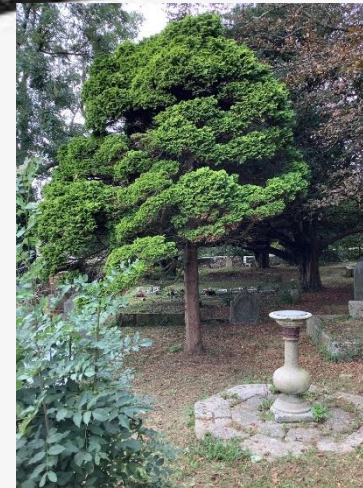
Pine (Possibly a pruned Cupressus Leylandi )